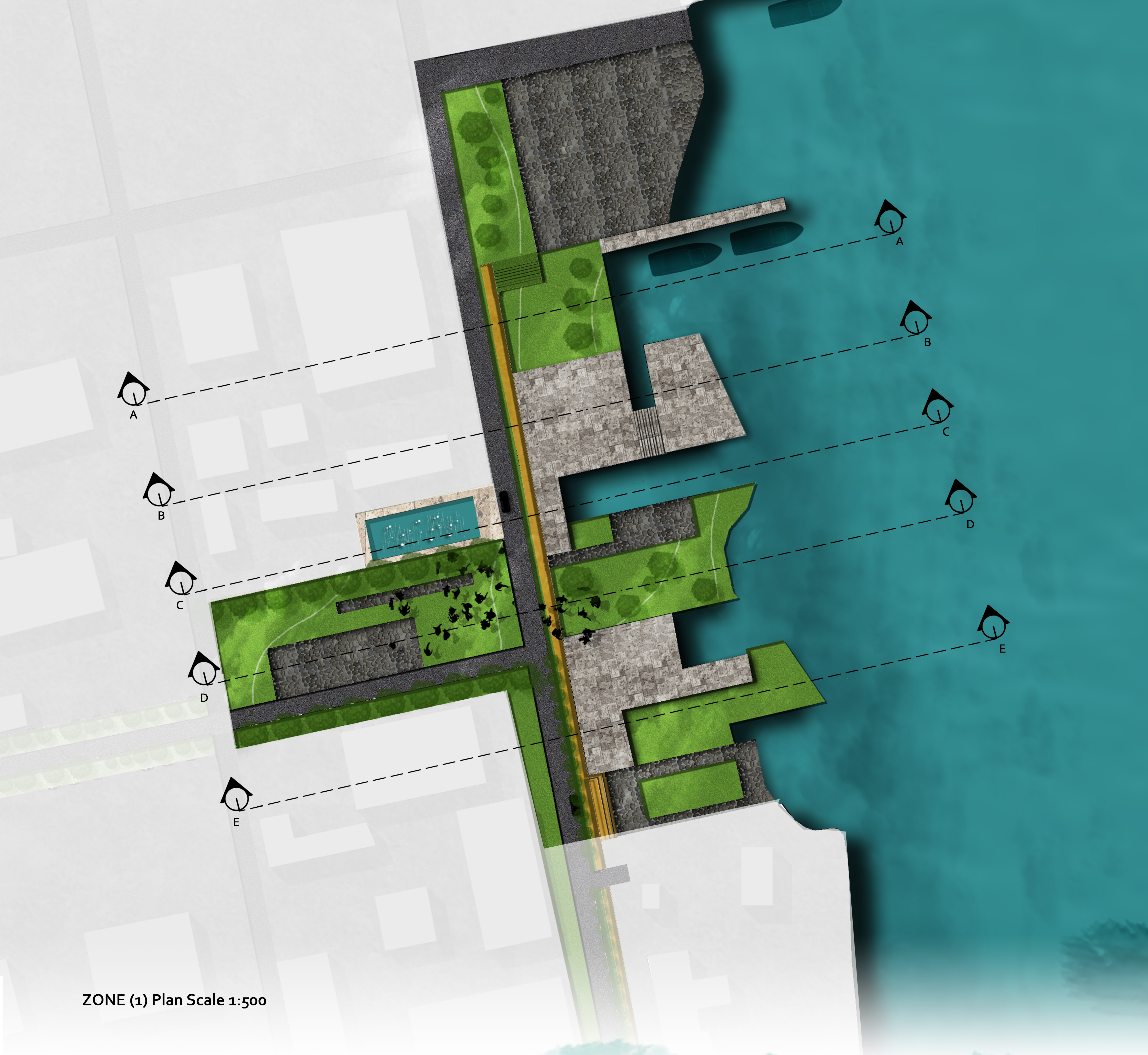
ZONE (1) Plan Scale 1:500