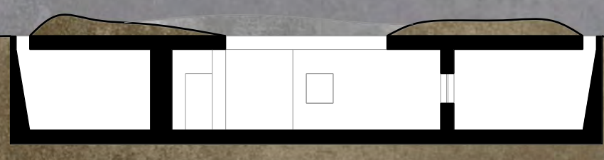
Section A_A1 1:200