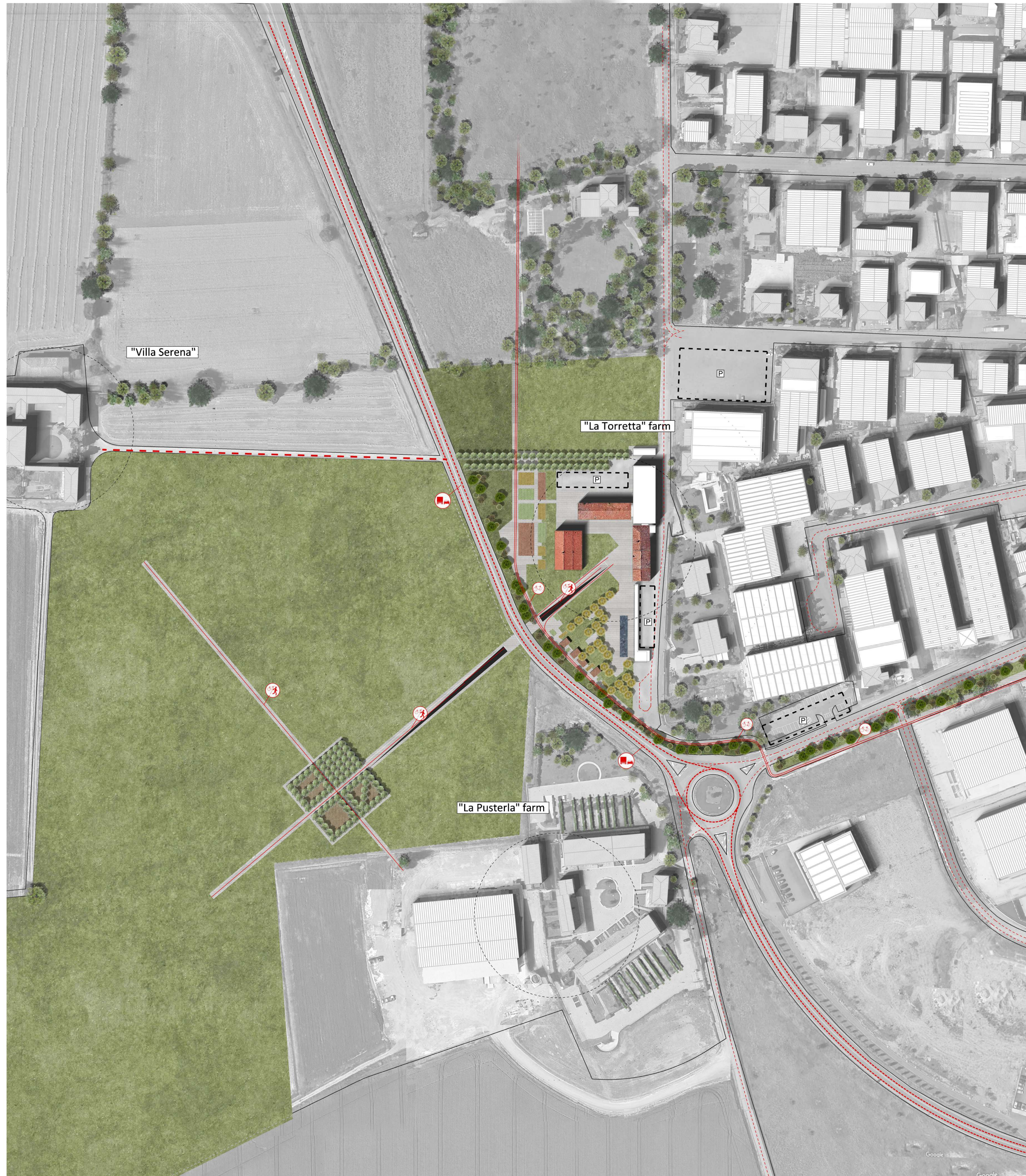
The new farm with the surroundig