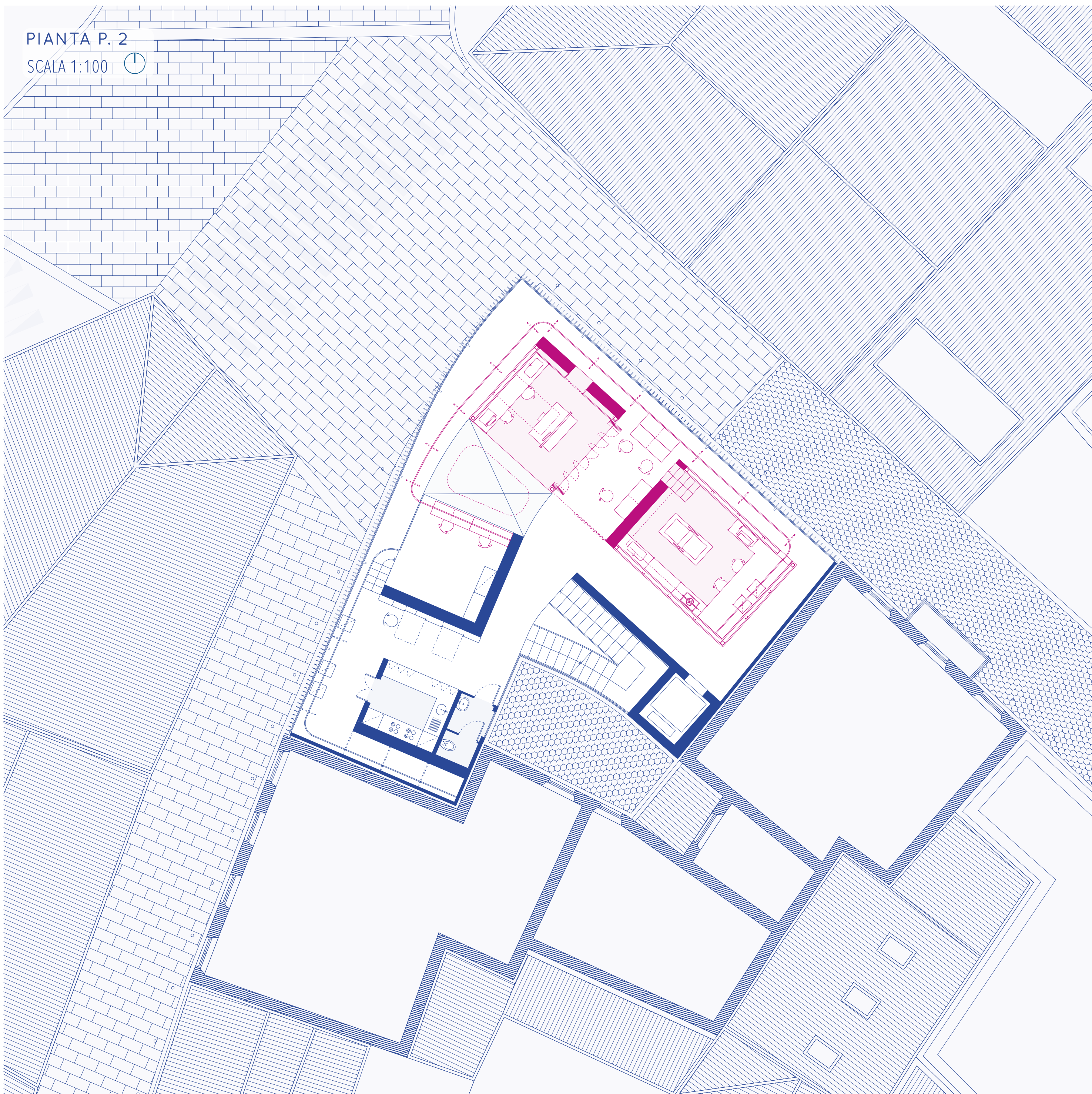
PIANTA P. 2 SCALA 1:100