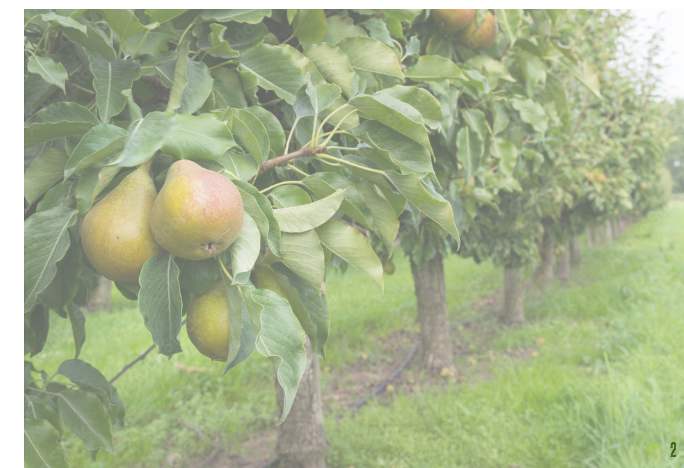
pear tree harvest Pera Mantovana IGP