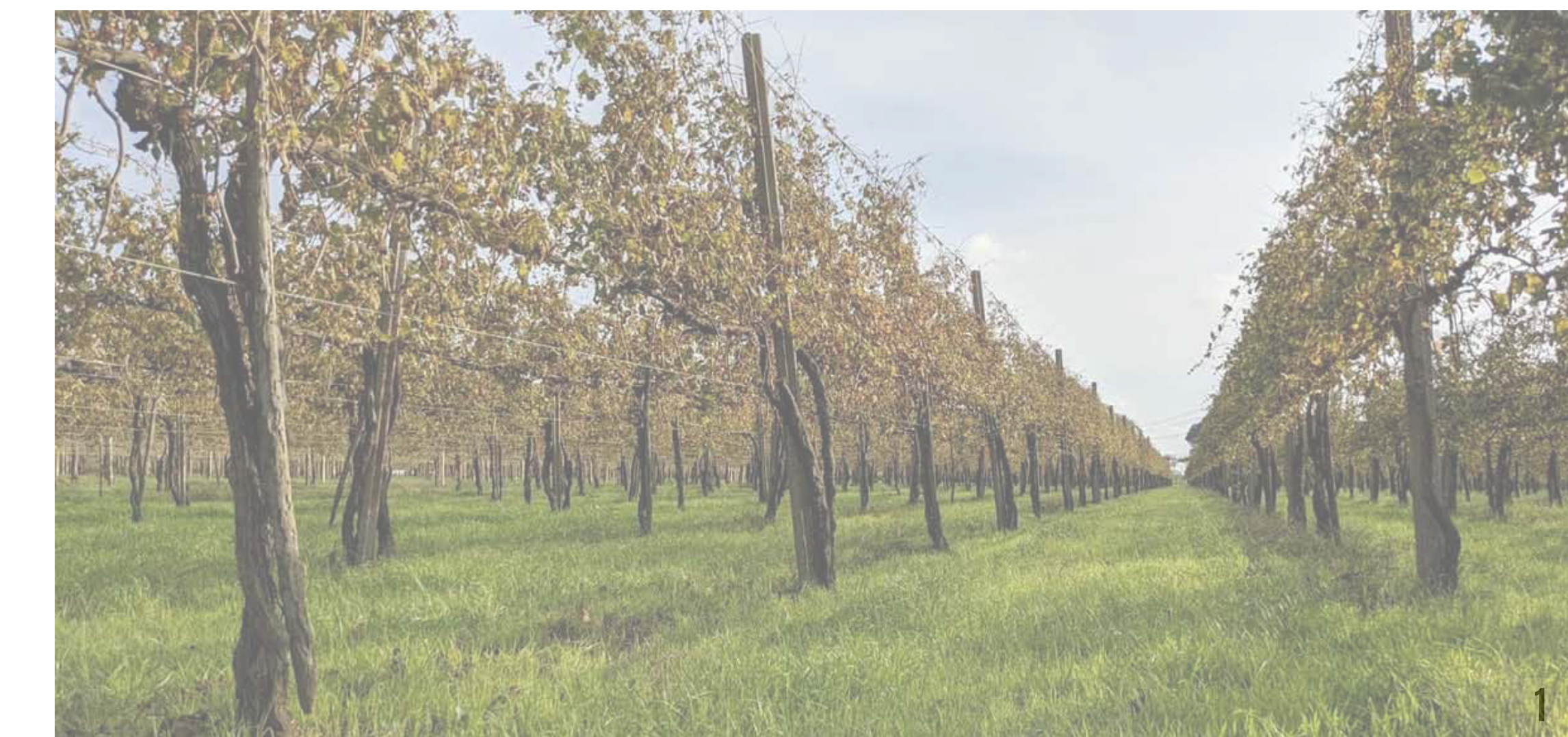
la piantata di vite maritata: the vinegrape traditional system cultivation Lambrusco Mantovano DOC