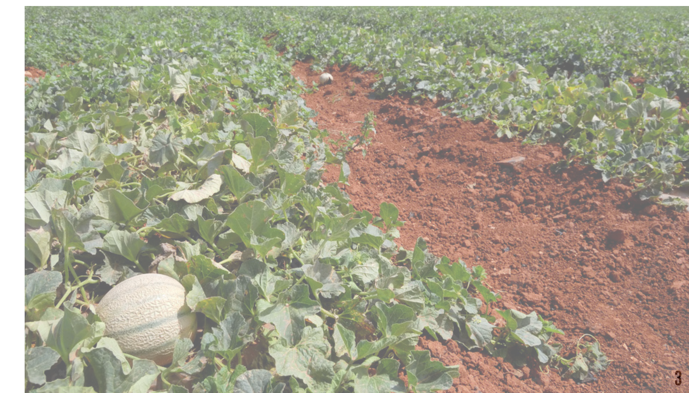
melon harvest Melone mantovano IGP