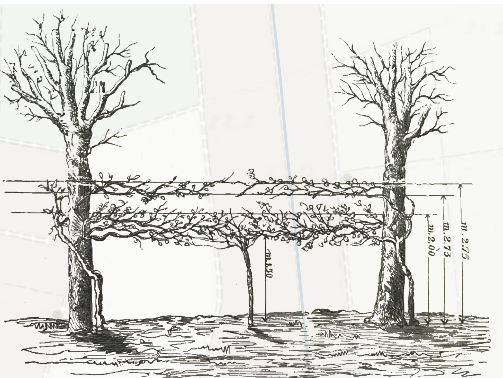
vite maritata system of cultivation

mulberry tree The grapevine "married" with the mulberry was one of the elements which contributed to the development of the rural landscape in Italy. From the late Middle Age to the end of the XIX century, the grapevine was cultivated on a living support, composing rows which delimited land properties. This cultivation system is called "alberata" when the grapevine grows on a single tree, or "piantata", when tree rows are formed using the same technique. Land lots were divided with this coreographic and harmonic system.