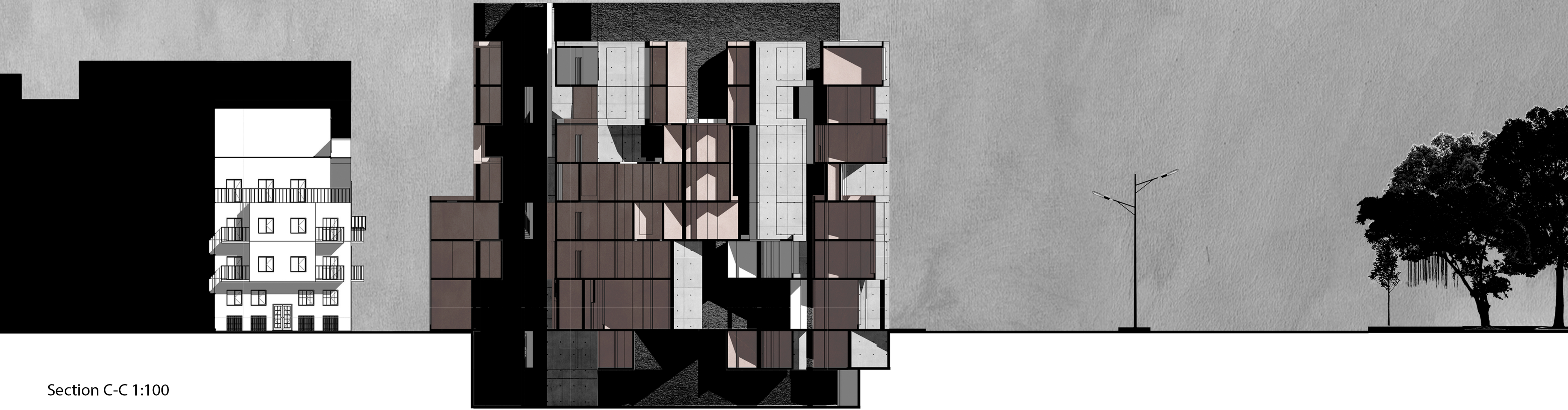
Section C-C 1:100