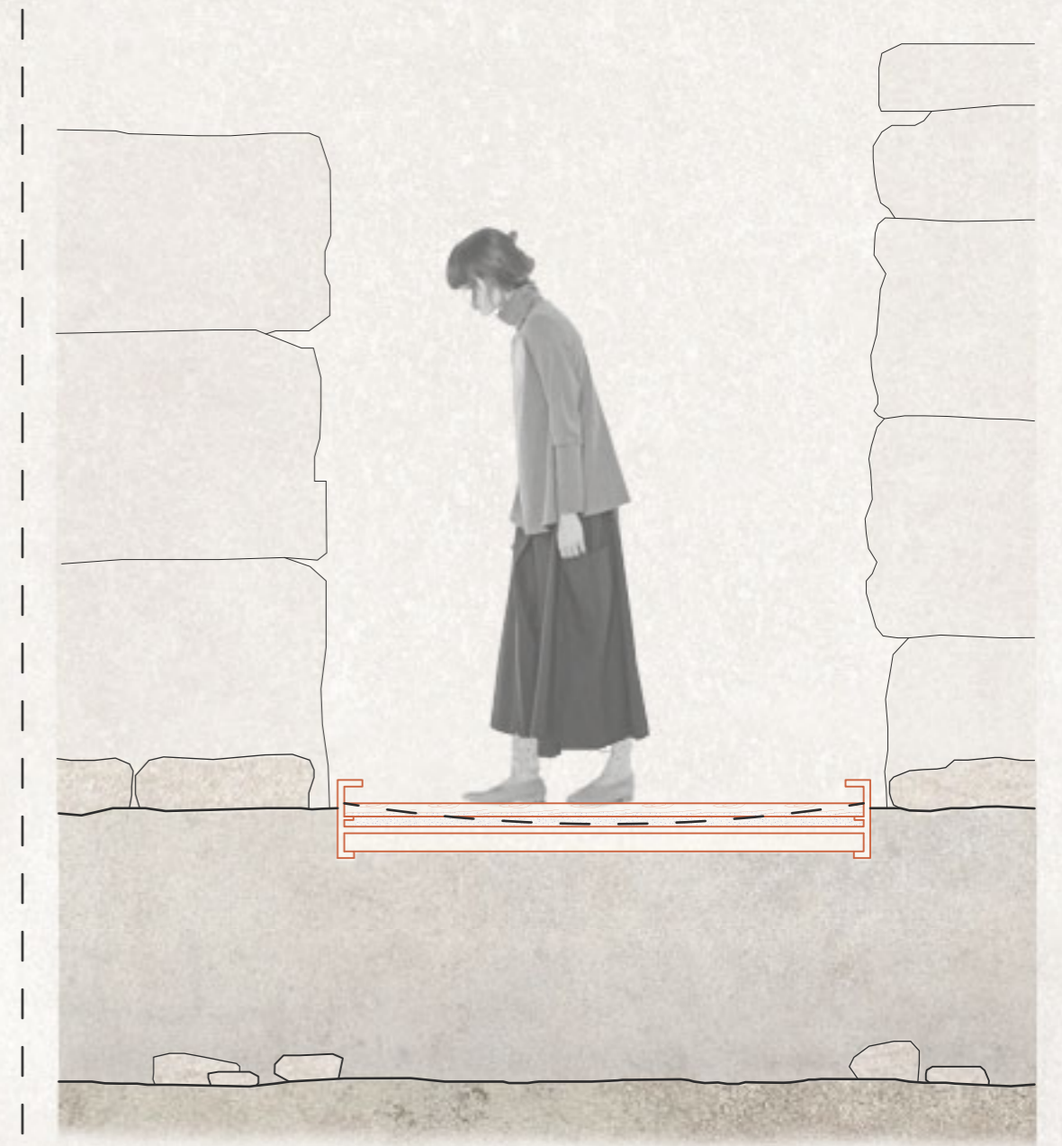
SECTION BB' 1:20