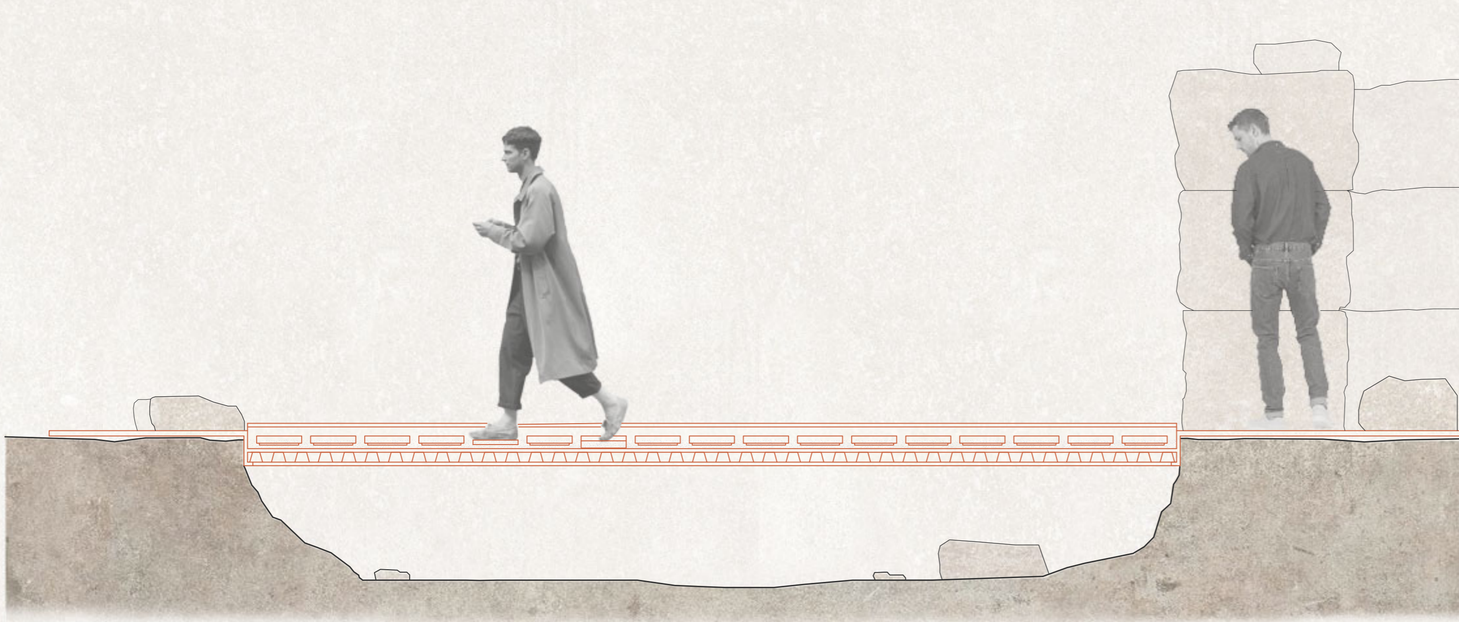
SECTION AA' 1:20