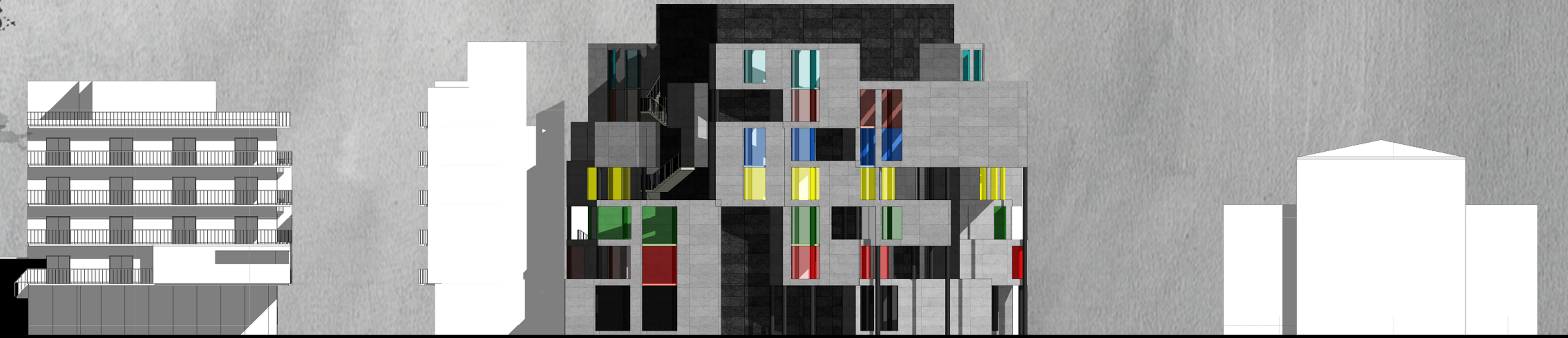
North Elevation 1:100